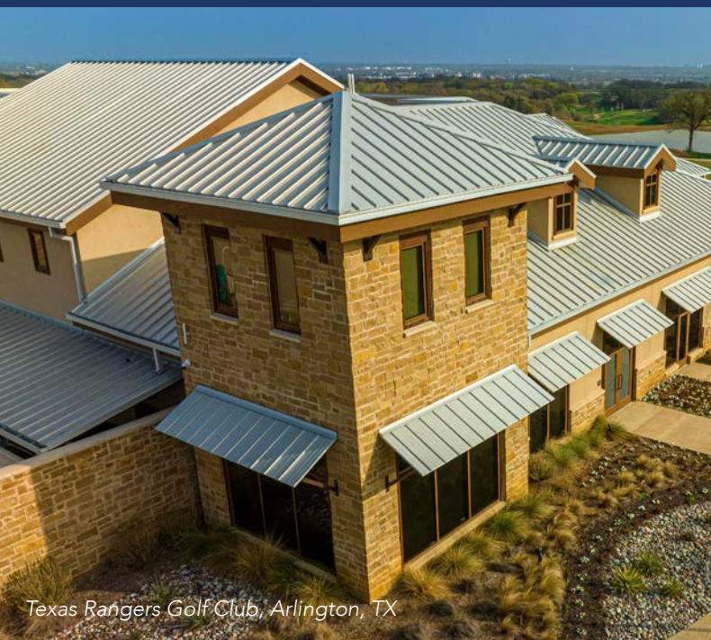
Texas Rangers Golf Club, Arlington, TX